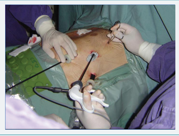
Figure 2: Minimally Invasive Approach for Stem Cells Implantation.