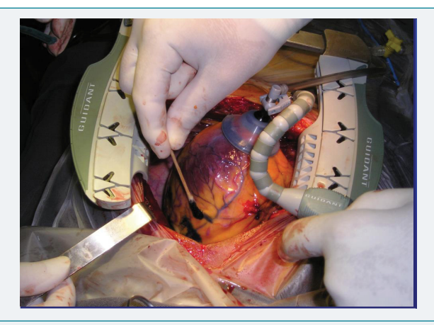
Figure 1: Sternotomy Blue marker for the 80 injections.

Video-assisted surgery includes positioning of three 10mm trocars in the 3^{rd} , 5^{th} and 7^{th} intercostal spaces: One for the camera and the rests for the instruments. We used a double-lumen ore-tracheal tube in this procedure, and the trocars are introduced once the left lung has been collapse. The camera is inserted posteriorly in the 7^{th} space (Figure 2).