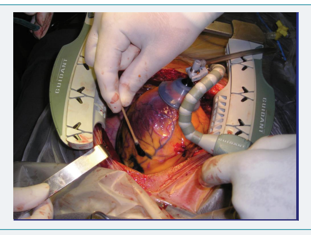
Figure 1: Sternotomy Blue marker for the 80 injections.

Video-assisted surgery includes positioning of three 10mm trocars in the 3<sup>rd</sup>, 5<sup>th</sup> and 7<sup>th</sup> intercostal spaces: One for the camera and the rests for the instruments. We used a double-lumen ore-tracheal tube in this procedure, and the trocars are introduced once the left lung has been collapse. The camera is inserted posteriorly in the 7<sup>th</sup> space (Figure 2).