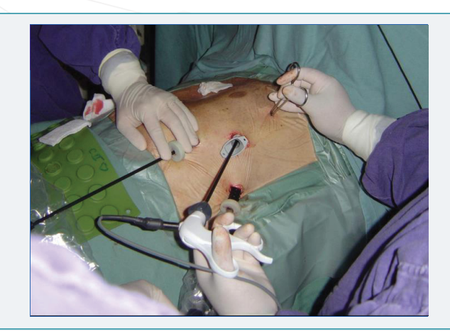
Figure 2: Minimally Invasive Approach for Stem Cells Implantation.